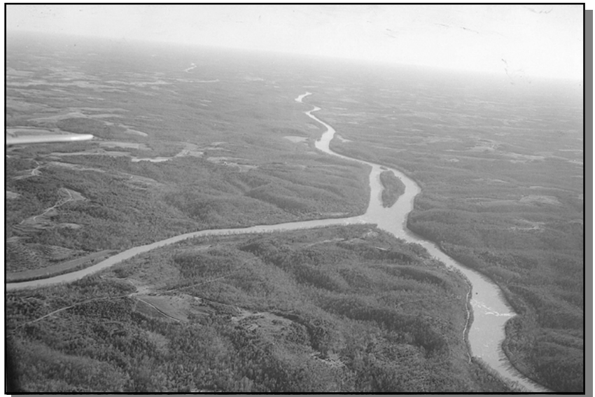
The Seneca River (left) met the Tugaloo River just downstream of what is now Andersonville Island. Hartwell Dam was built 7 miles downstream of the junction of these two rivers. This historic aerial photo (Nov. 20, 1957) is only one of many that can be found at http://www.sas.usace.army.mil/sample/histphotos.htm .

The entire Hartwell Lake project, built in the Savannah River Basin, comprises 76,450 acres of land and water. The dam impounds the lake that stretches 49 miles up the Tugaloo River and 45 miles up the Seneca River. Lake Hartwell covers nearly 56,000 acres and has 962 miles of shoreline. The dam was completed in 1963 at a cost of over $89 million. It is located 7 miles below the point at which the Tugaloo and Seneca rivers join to form the Savannah and spans 18,000 feet (over 3 miles!). It is constructed of earth and concrete. Its concrete section is 1,900 feet long and rises 204 feet above the riverbed at its highest point. The spillway section contains 12 gates (40 feet wide, 35 feet high). END