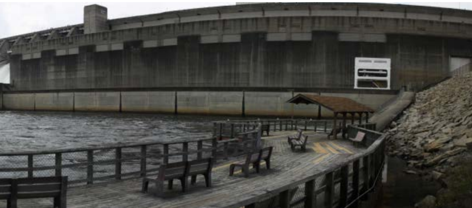
Lake Thurmond Dam