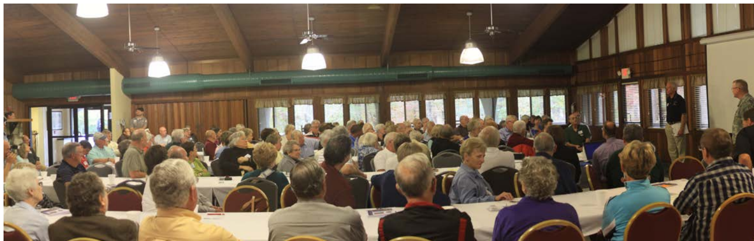
LHA Annual Meeting in October, 2012

The 2012 LHA Annual Meeting at Kresge Hall, Clemson Outdoor Lab, was so well attended, and the response was so positive, we're planning to do it again on Saturday, October 5, 2013. (There is no Clemson game on that date!)