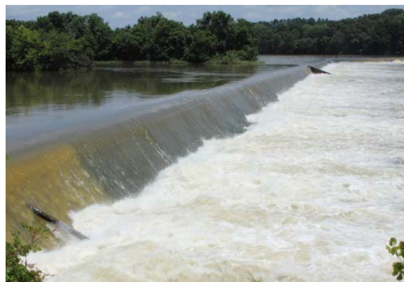
Savannah River Down Stream