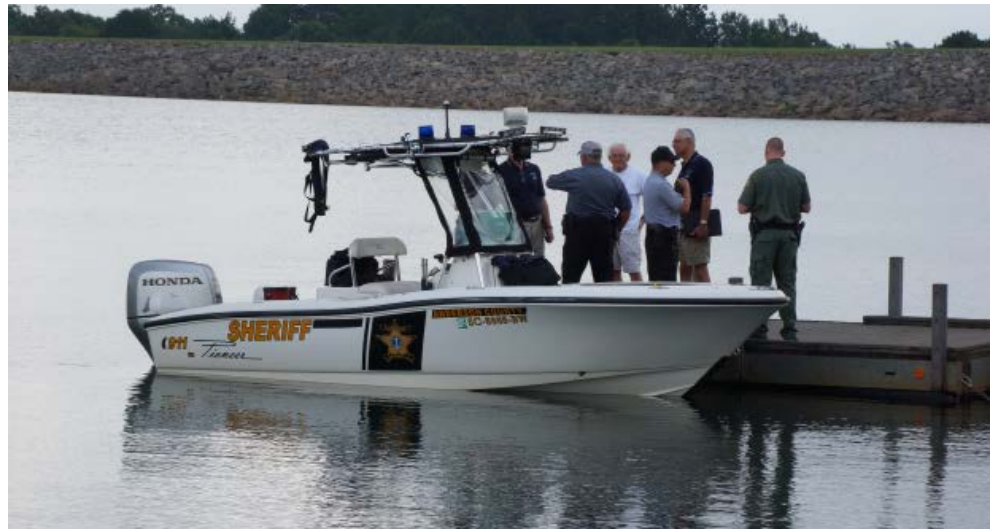
LHA Anderson County Marine One at Media Day