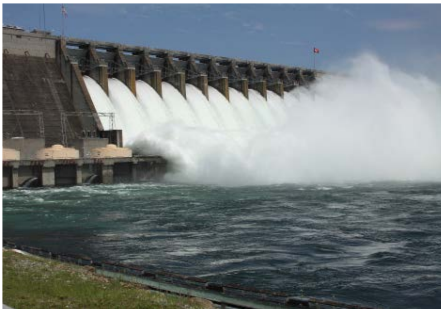
Lake Hartwell Dam