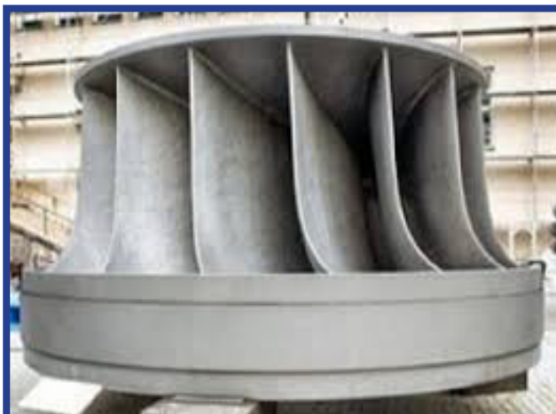
Hartwell rotor removed for cleaning

All this electrical energy is produced by harnessing the water from Lake Hartwell through tunnels in the dam. The water traveling through these passages causes the turbines to turn. The turbines then make generators rotate producing electrical power. The engineers at the dam control the amount of water let through the dam and when excess water is present in the reservoir the spillways are used. The spillways which look like long ramps are empty and dry most of the time.