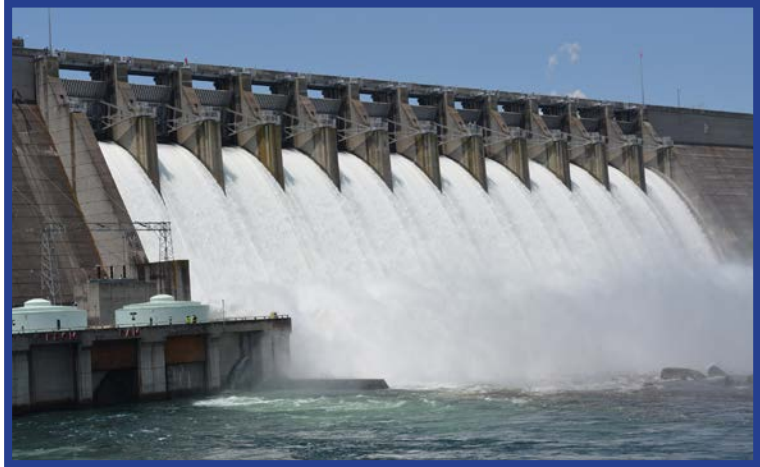
All spillways open for testing

When the Hartwell dam generates power it provides millions of customers with low-cost power through electric cooperatives, and investor owned utilities in North Carolina, South Carolina, Georgia, Florida, Alabama, and Mississippi. The power generated is sent over three transmission lines, one owned by Georgia Power and the two owned by Duke Power, to the power grid. Marketing this power to various customers is the responsibility of the Southeastern Power Administration (SEPA) headquartered in Elberton, GA. SEPA oversees marketing of hydroelectric power from 23 dams and water projects operated by the US Corps of Engineers in West Virginia, Virginia, Florida, Alabama, Mississippi, Tennessee, and Kentucky.