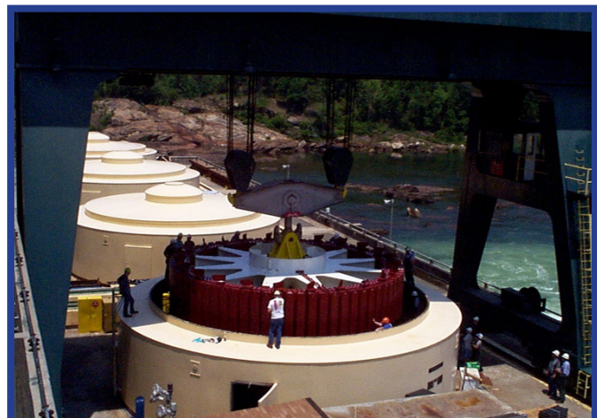
Rotor being pulled from unit