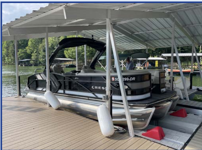
Wave Armor Pontoon Dock

The Touchless Cover has a 5-year limited warranty.